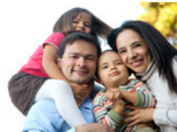
How well do you know your families?

March and April bring multiple opportunities for providers to participate in training. On Monday, March 14th, providers can attend two trainings in one evening. Penn State Extension will play host at the Courthouse Annex Building on Water Street in Indiana. From 5:30 to 7:30 pm the topic will be “Giving Your Best: Making Secure Attachments.” Learn what you can provide for children today to help prepare them to be successful adults tomorrow. Cost: $7. Then stay for session number two starting at 7:30 entitled, “Every Child Counts: Building Community.” This training will help you learn how to bring children together to create a sense of