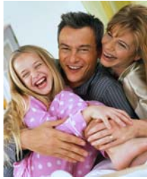
Every child deserves love!

The way to help is to focus on our neighborhoods and community. We can't fix the nation but we can do one thing to help our neighbors and