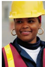
Income is based on wages before taxes.

Income eligibility for subsidized child day care is established and updated by the Department of Public Welfare. Need for subsidized child care is based on the parent/caretaker(s) in the household being employed at least 20 hours per week or a combination of work and training to equal 20 hours per week. Eligibility is determined on family size and monthly gross income, before taxes. Effective May 2, 2011, the income guidelines have been increased as follows: